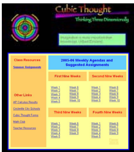
Screen Image of Cubic Thought Website